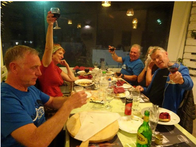
post CLIMB grub .....CHEERS!